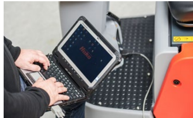
Easy access to the diagnosis interface for maintenance purposes and to modify machine settings.

Coordinated by a GPS-controlled assignment planning system, 650 field technicians are available for you around the clock to ensure maximum machine availability and minimum downtimes. In addition, our highly efficient spare part logistics guarantees direct over-night delivery of original spare parts.