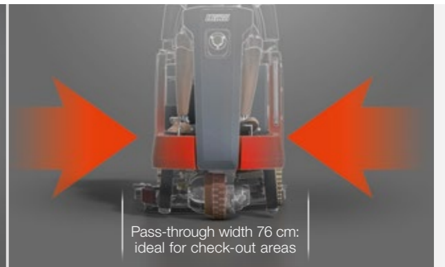
Pass-through width 76 cm: ideal for check-out areas