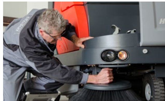
Easy access to all relevant components ensures uncomplicated maintenance and servicing.

Blue Competence is an initiative of VDMA ( www.vdma.org ). By engaging in this partnership, we are committed to comply with the twelve sustainability principles applied in the field of mechanical and system engineering ( www.bluecompetence.net/about ).