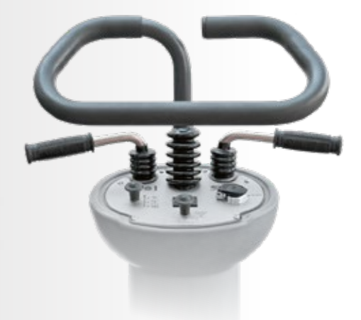
Comfortable workplace The large steering handle and the intuitive operating elements provide ease of use.