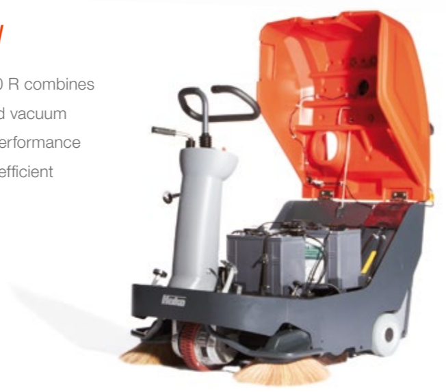
Clear structure All components are easily accessible to ensure uncomplicated maintenance.

The battery-powered Sweepmaster B800 R combines the compact dimensions of a walk-behind vacuum sweeper with the superior comfort and performance of a ride-on machine to provide fast and efficient cleaning of small to medium-sized areas.