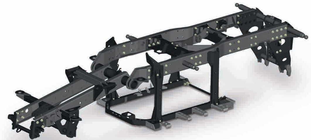
The frame construction of the Multicar M29: Made of high-quality material and manufactured in Germany, robust and stable – the basis of a safe vehicle.

Elaborately spring-mounted heavy-duty commercial vehicle axles 'made in Germany' provide the high payload of the Multicar M29 and ensure safe driving and operation. The heavy-duty frame, providing stable road-holding characteristics in all operating situations, is another aspect of the safety concept.