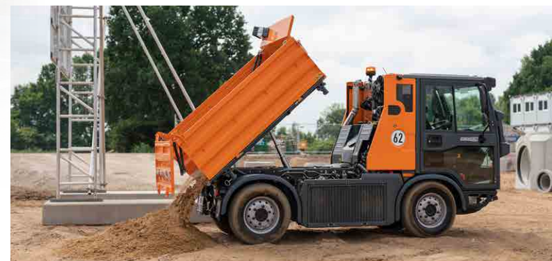
Flexible design as standard: The quick-change systems of the Multicar M29. In the picture: robust attachment triangle for front attachments.