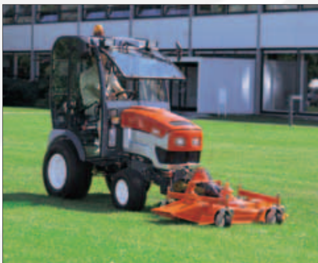
Wide tyres which protect the floor surface and powerful front mounted rotary mower – giving excellent results even on critical/sensitive surfaces.

Finance alternatives, which can be tailored to suit your requirements: outright purchase, hire, leasing, rental, full service.