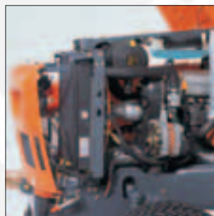
Simple and quick access to all important components for daily inspection.