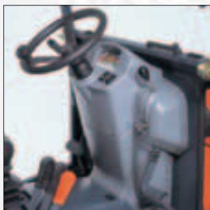
Clearly laid out cockpit with all important functions in direct view.