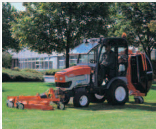
Compact collection system for front and inter-axle mowers up to 600 l capacity, available as an option with high dump for efficient mowing.