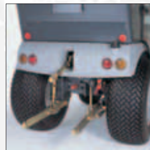
Large fuel tank 26 l for long periods of operation and greater economy.