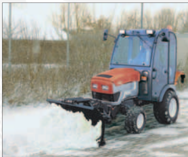
Winter use with snow shield up to 1.50 m working width and sand and salt spreader/gritter 120 l. Comfortable, well-ventilated and heated cab.