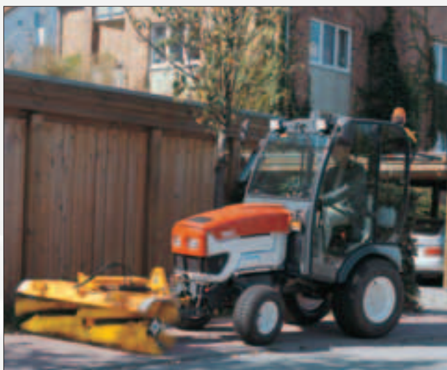
Front mounted sweeper up to 1.50 m working width for use in winter and summer. Dirt sweeping machine also with collection hopper and side brush.