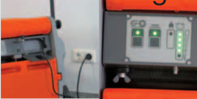
On-board charger to charge at any available plug socket. Most simple operation and clear information.