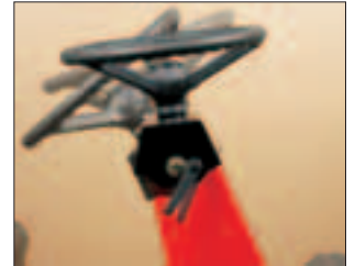
Adjustable steering wheel.