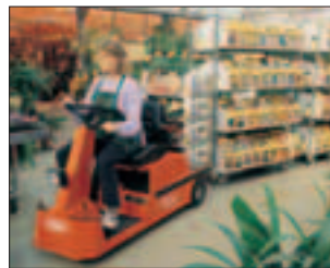
The pulling power of attractive sales stands.