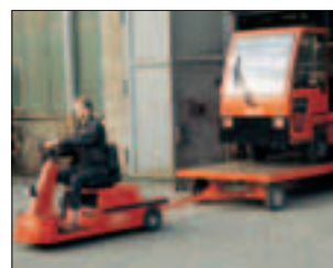
With up to 2 tons being towed.

Hako-Sherpas delivering spare parts in the municipal rail depot.