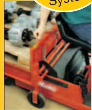
The patented Hako piggyback system