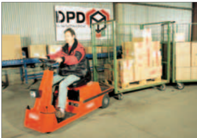
Rapid distribution with a conveyor belt and an Hako Sherpa trailer combination.