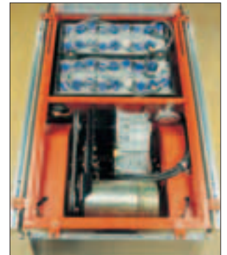
3,0 kW drive motor.