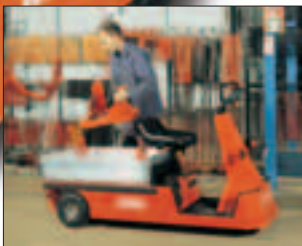
Hako-Sherpa with special loading platform for varnished components.