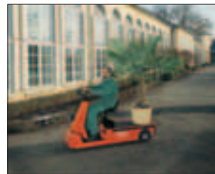
Also ideal for open air applications on consolidated tracks.