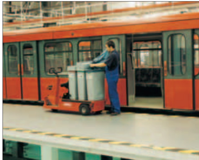
A mobile team of cleaners provides rapid cleaning.