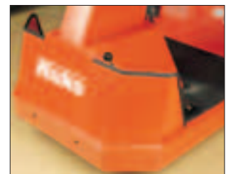
Solid steel frame with robust impact and foot protection.