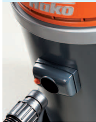
Click system enables quick uncoupling of the suction hose from the housing.