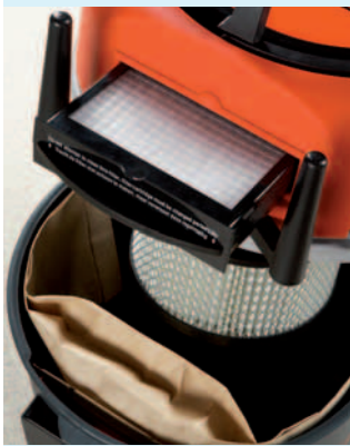
Triple filtration as a result of cartridge filter and paper filter as well as a special used air filter.