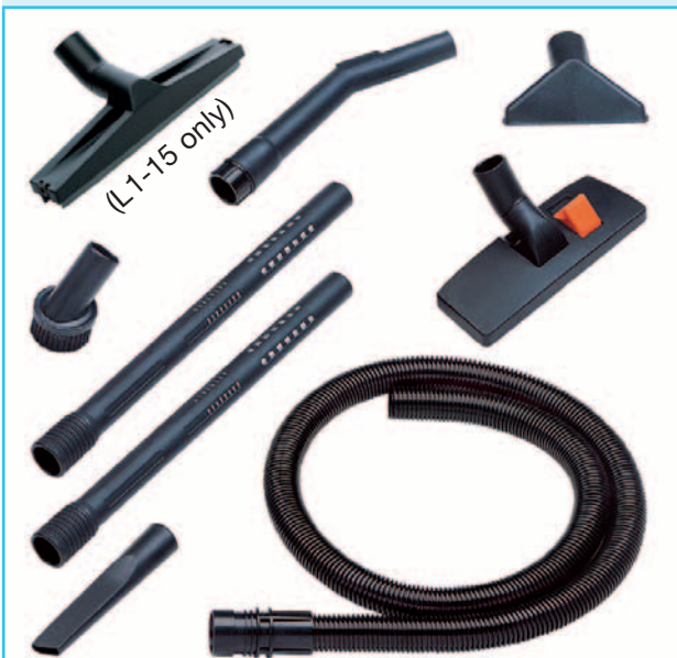
Accessories Hako-Supervac D 5, L 1-15