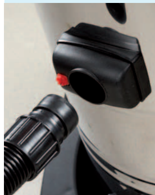
Hopper made of high-grade stainless steel with click system for quick uncoupling of the suction hose.