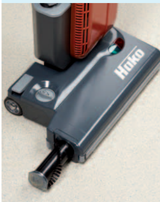
Brush change without tools at the side on the electro brush.