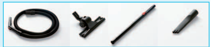
Accessories Hako-Supervac D 6 CL