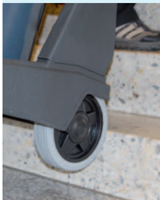
Large wheels to get over thresholds and steps without problem.