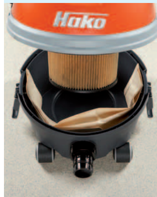
Double filtration as a result of cartridge filter and paper filter.