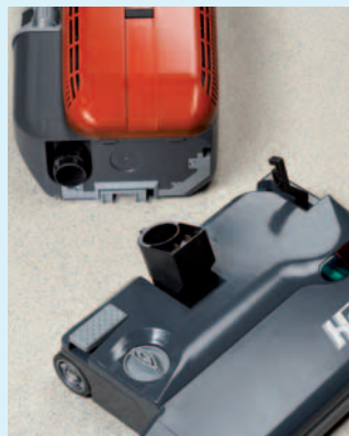
Access to the suction channel without tools for maintenance work.