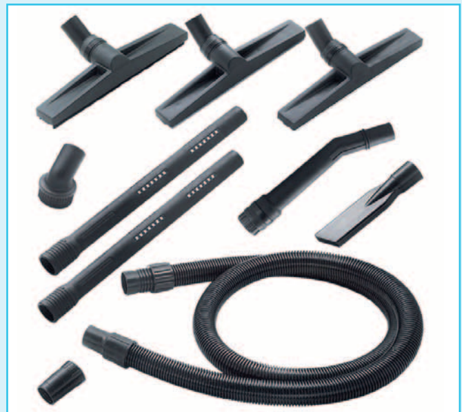
Accessories Hako-Supervac L 1-30, L 2-70, L 3-70 I