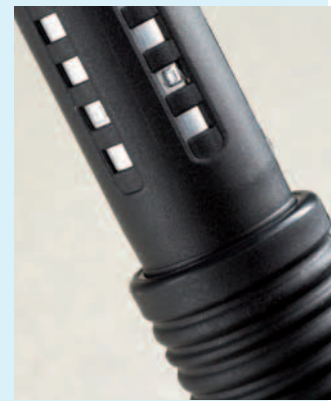
Lightweight aluminium suction pipe, covered in synthetic material offers high impact resistance.