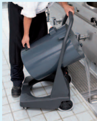
Emptying liquids via the handy tipping device.