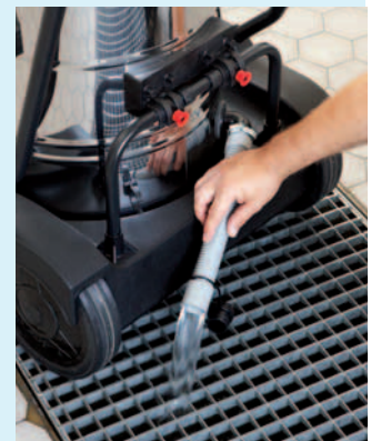
Handy outlet hose to empty liquids.