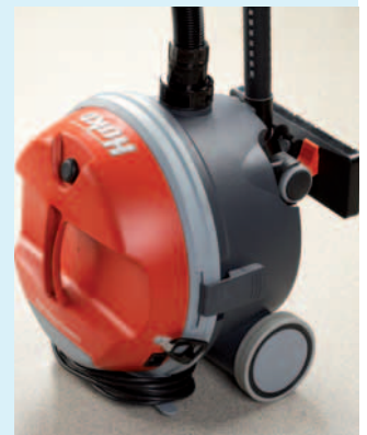
Space-saving storage thanks to the vertical parking position and holder for suction pipe.