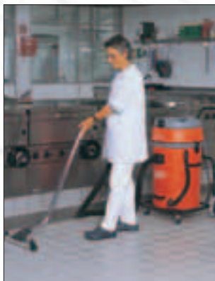
Hako-Supervac 550. Swallows everything in sight. Seen here being used as a wet vacuum in kitchen areas.