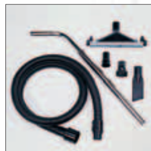
Equipped as standard with numerous accessories for wet and dry cleaning. The vacuum hose is particularly large.

The cooled by-pass motors and indestructible tank made of chrome steel guarantee a long machine life.