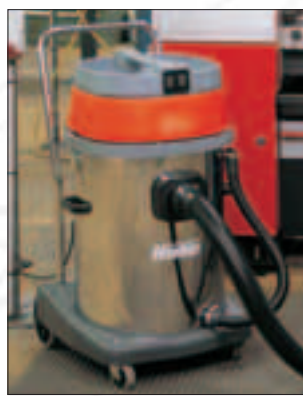
Further advantages: Sturdy connections between suction head and tank, robust chassis with stable handle.