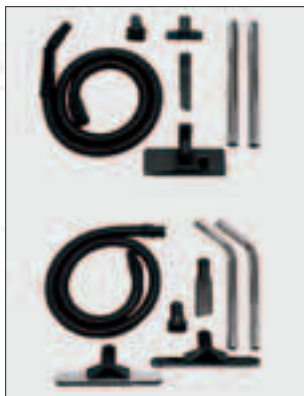
Comprehensive range of multi-purpose accessories for daily wet and dry cleaning depending upon the type of machine and application in question.