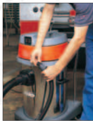
Handy drainage hose for easy emptying of liquids.