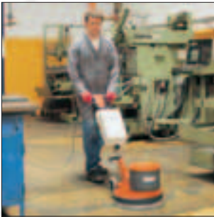
Single disc machines for cleaning hard floors and carpets.