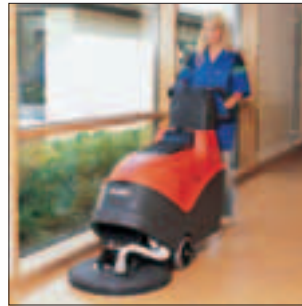
Hako polishing machines for a shining result.