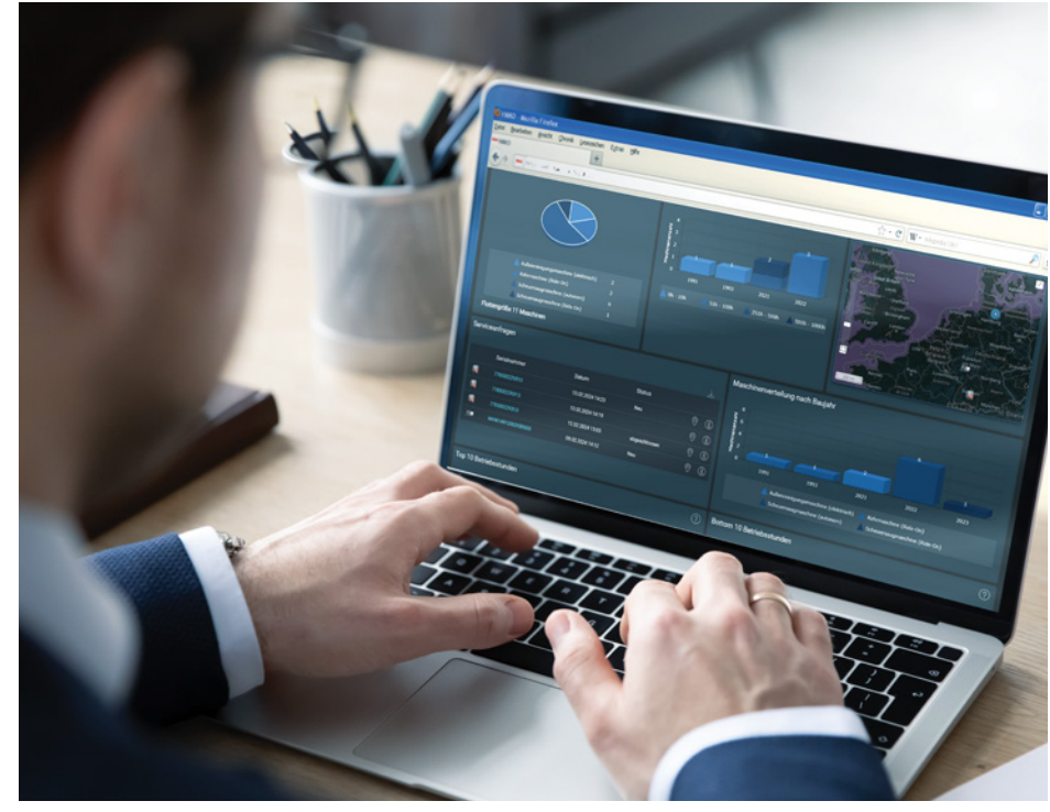
Hako Elect Management with a new dashboard: more functions, more usability, more option