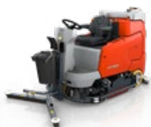
Pre-sweep tool "Broom" – option for Scrubmaster B175 R, B260 R and B400 R