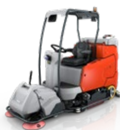
Pre-sweep/vacuum unit with DustStop – option for low-dust sweeping and reduced fine particulate development for Scrubmaster B175 R and B260 R