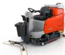
Pre-sweep tool "Mop" – option for Scrubmaster B175 R, B260 R and B400 R