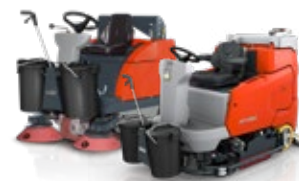
Tool "Light-debris collector" – option for Scrubmaster B175 R, B260 R and B400 R, and Sweepmaster 900 R and 980 R/RH

Hako GmbH Head Office Hamburger Str. 209-239 23843 Bad Oldesloe Tel. +49 (0) 4531-806 0 info@hako.com www.hako.com