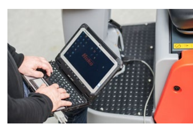
Easy access to the diagnosis interface for maintenance purposes and to modify machine settings.

Coordinated by a GPS-controlled assignment planning system, 650 field technicians are available for you around the clock to ensure maximum machine availability and minimum downtimes. In addition, our highly efficient spare part logistics guarantees direct over-night delivery of original spare parts.