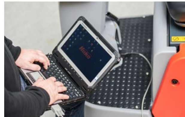
Easy access to the diagnosis interface for maintenance purposes and to modify machine settings.

Coordinated by a GPS-controlled assignment planning system, 650 field technicians are available for you around the clock to ensure maximum machine availability and minimum downtimes. In addition, our highly efficient spare part logistics guarantees direct over-night delivery of original spare parts.