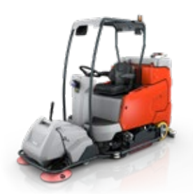
Pre-sweep/vacuum unit with Dust Stop -

option for low-dust sweeping and reduced fine particulate development for Scrubmaster B400 R and B175 R and B260 R